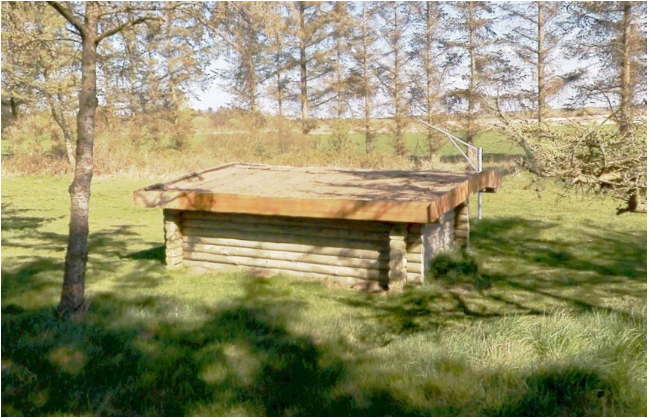
Foto af eksisterende Shelter